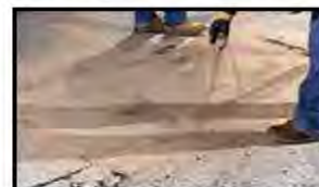
Cover with sand.