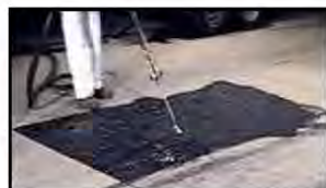
Flood with Concrete Welder.

Stabilize rocking slab by injecting Concrete Welder into the joint until the slab is stabilized. (If not stabilized, the slab will be rocked by vehicles passing in adjacent lane.) Do not overfill.