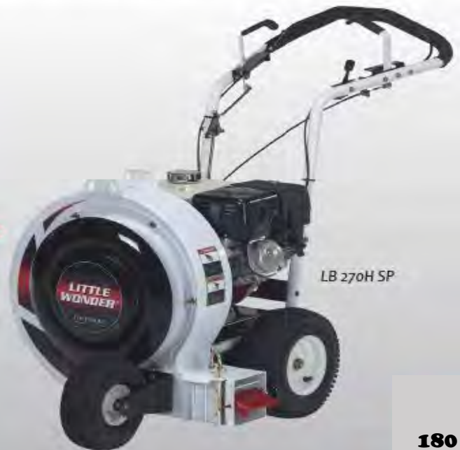
LB 270H SP