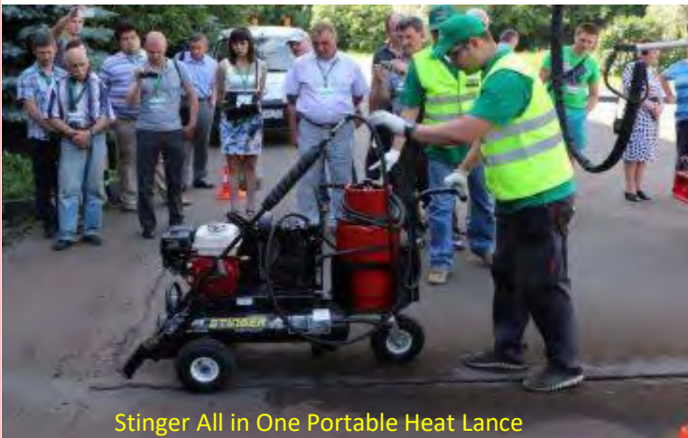
Stinger All in One Portable Heat Lance

Rugged Stainless Steel Construction for years of trouble free operation