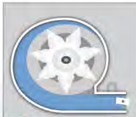
Steel scrolled housing.

Reverse angle steel fans provide power. These fans are stronger than ever, built with the advanced welding technology. The blades are stamped from a single piece of 10 gauge steel and then welded to the hub with a precision robot to create a solid connection. The 270cc and larger fans are dual plane balanced to tighter tolerance—to reduce stress and vibration.