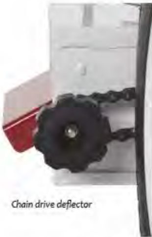
Chain drive deflector

Each job is different and the conditions change with the weather. There are days when you need to peel wet leaves off the ground, and other times when you want to keep leaves low so the wind doesn't take them away. Set the exclusive Little Wonder split stream deflector for your job, and gain control.