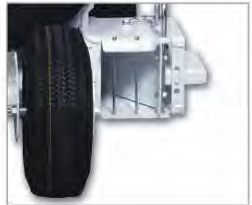
Built in front discharge.