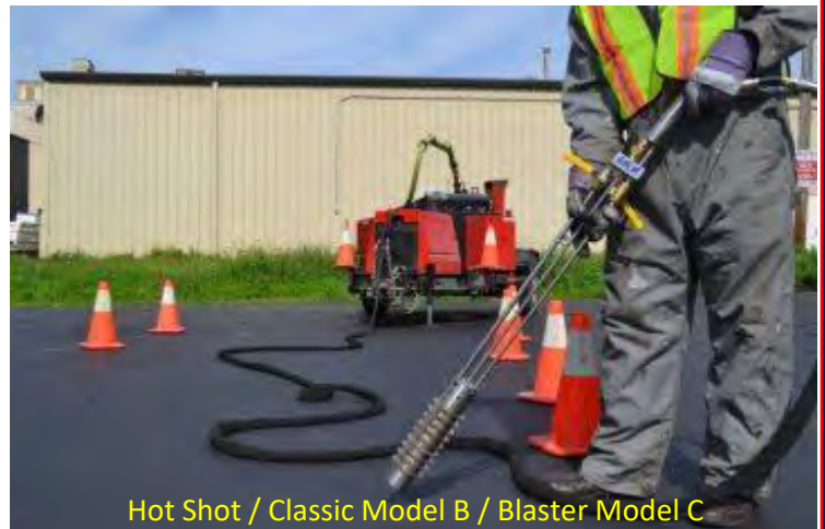
Hot Shot / Classic Model B / Blaster Model C

LAB Hot Air Lances blast out dirt & debris with Hot Compressed Air. They Draw out moisture from cracks without “over cooking”; lifting off oxidized surface leaving a warm, dry surface, properly prepared sealant adhesion.